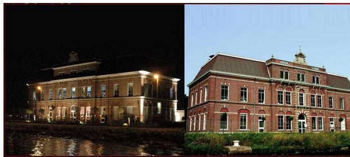
Taets Art Gallery, Hemkade 18, Zaandam, info@iranartfestival.nl

with one of the Iranian artists amidst his or her work. Furthermore, there are several smaller rooms that continuously show art-videos, short films, and impressions of Iran. The Iranian Lounge is the perfect place to relax and exchange views.